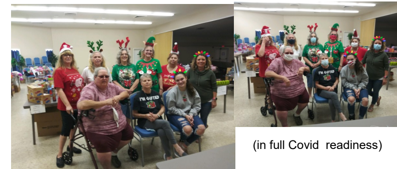
(in full Covid readiness)

Toy Gift Shop —Thank you for all the help this year. The church managed to serve over 100 children. Thank you for blessing others.